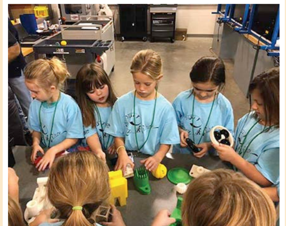
Attica Elementary School students on a "Walk Into My Future" field trip to Ivy Tech